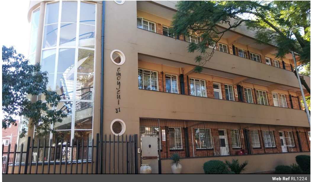
Web Ref RL1224

PLEASE NOTE: The use of any Emergency Contractors are at your Own Risk and may be for your own account.