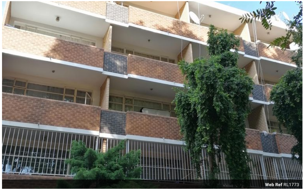
Web Ref RL1773

PLEASE NOTE: The use of any Emergency Contractors are at your Own Risk and may be for your own account.