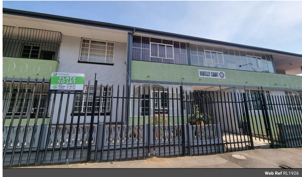
Web Ref RL1926

PLEASE NOTE: The use of any Emergency Contractors are at your Own Risk and may be for your own account.