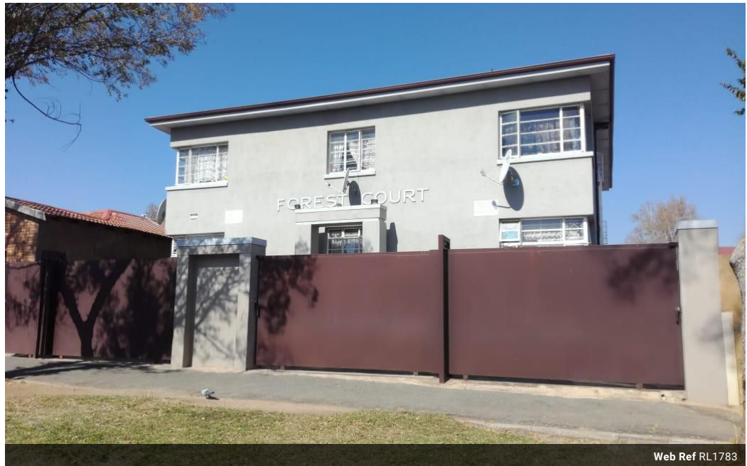
Web Ref RL1783

PLEASE NOTE: The use of any Emergency Contractors are at your Own Risk and may be for your own account.