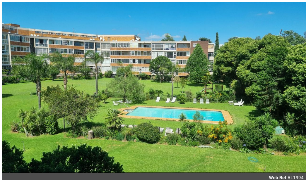
Web Ref RL1994

PLEASE NOTE: The use of any Emergency Contractors are at your Own Risk and may be for your own account.