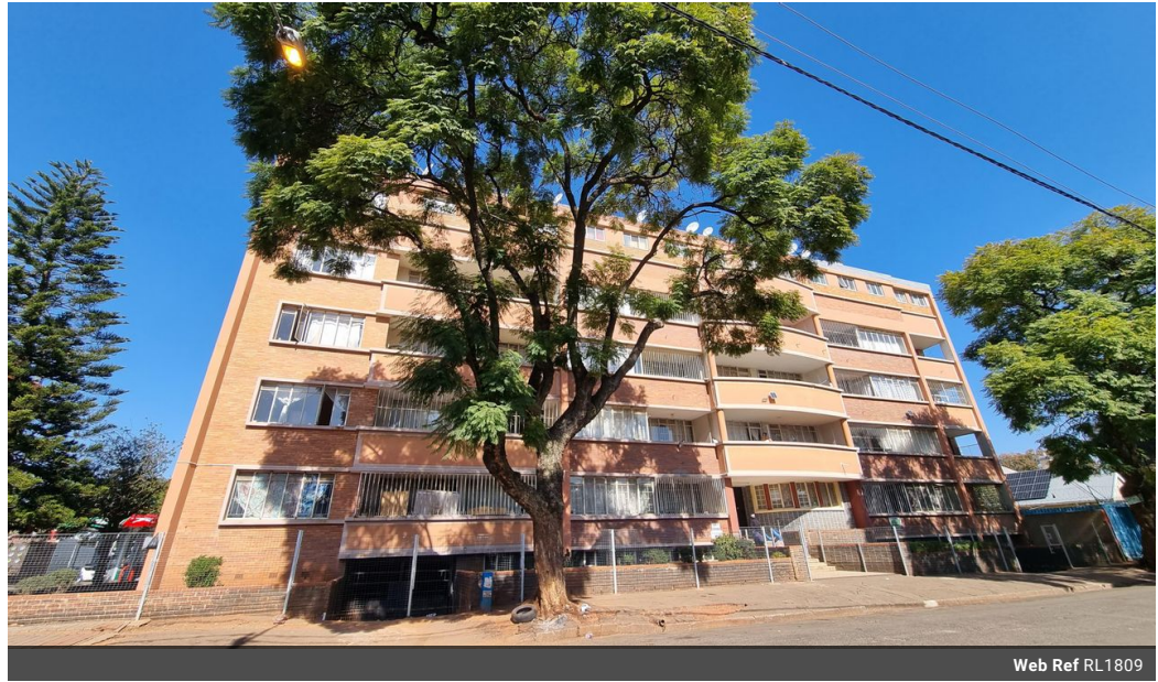
Web Ref RL1809

PLEASE NOTE: The use of any Emergency Contractors are at your Own Risk and may be for your own account.