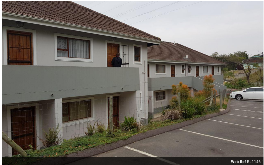
Web Ref RL1146

PLEASE NOTE: The use of any Emergency Contractors are at your Own Risk and may be for your own account.